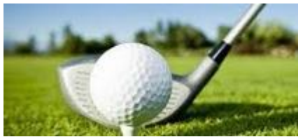
Annual Golf Fundraiser- July 18th, 2016. Where: Raspberry Falls Golf Club

We are looking forward to several upcoming yearly fundraisers- Casino Night, Wine County Half Marathon, and the Annual Golf Tournament. These help to raise money to keep Special Olympics completely free to all our athletes. Each Area is responsible for raising its own funds to keep their programs running, so please volunteer or donate!