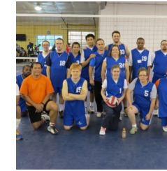
Area 14 Loudoun Bumping Bearcats