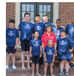
Area 14 Loudoun Dolphins